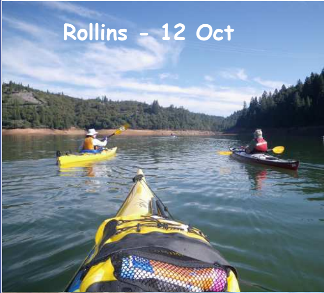
Rollins - 12 Oct