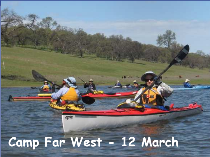
Camp Far West - 12 March