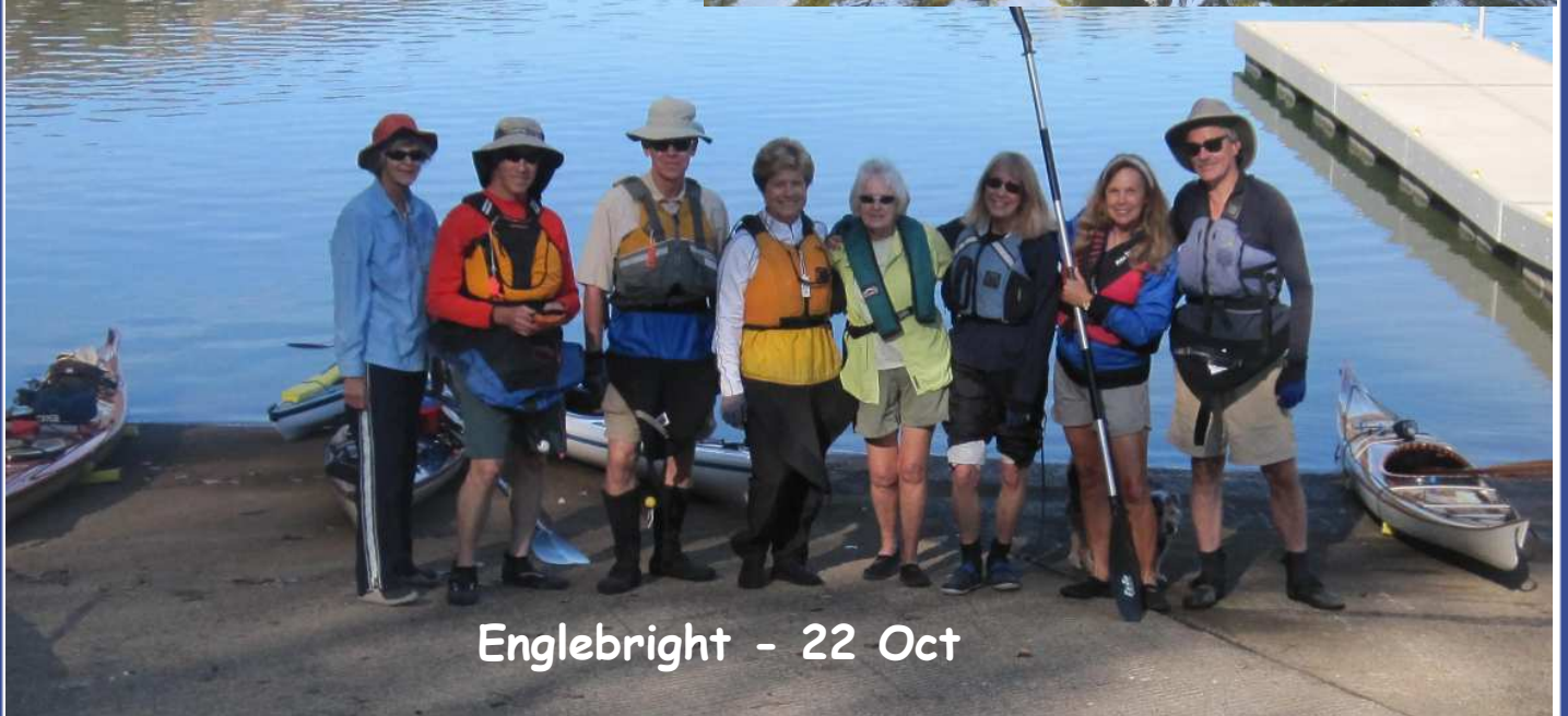
Englebright - 22 Oct