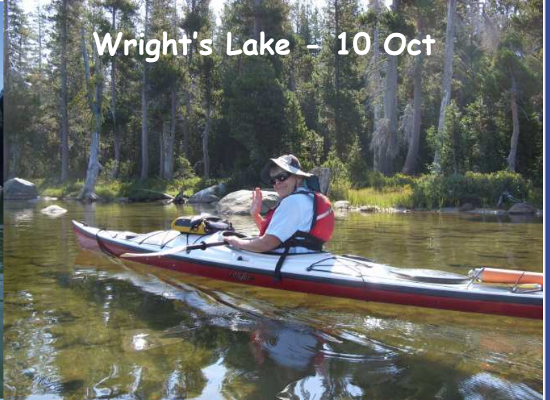
Wright's Lake - 10 Oct