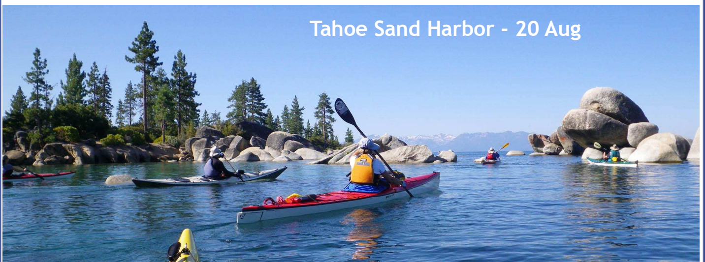
Tahoe Sand Harbor - 20 Aug