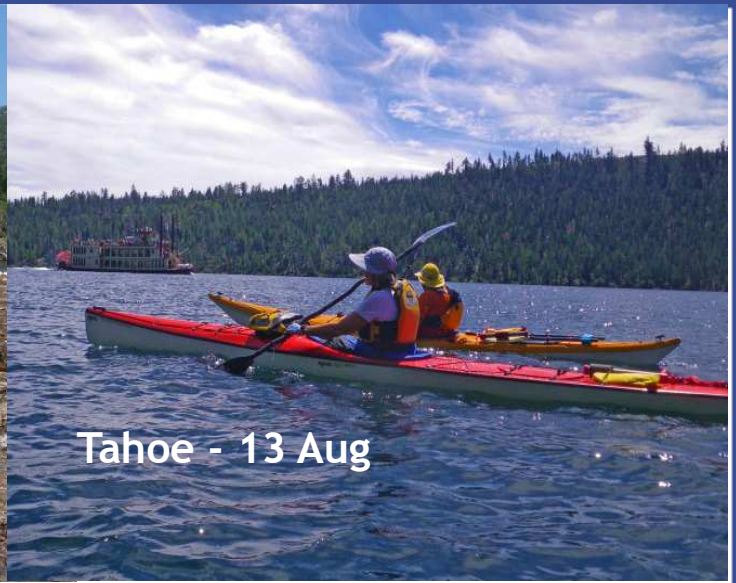
Tahoe - 13 Aug