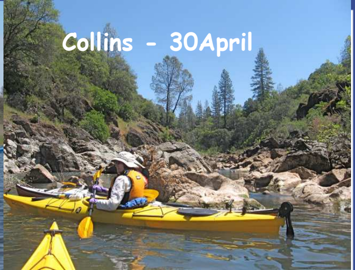
Collins - 30 April