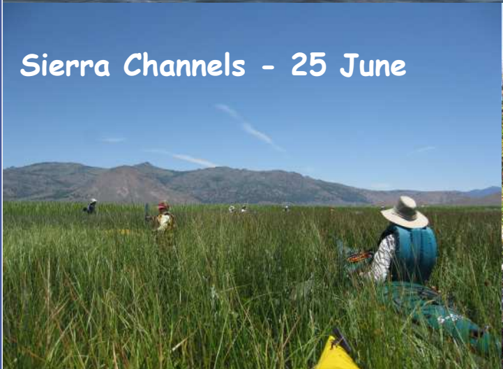
Sierra Channels - 25 June