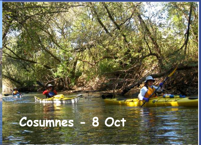
Cosumnes - 8 Oct