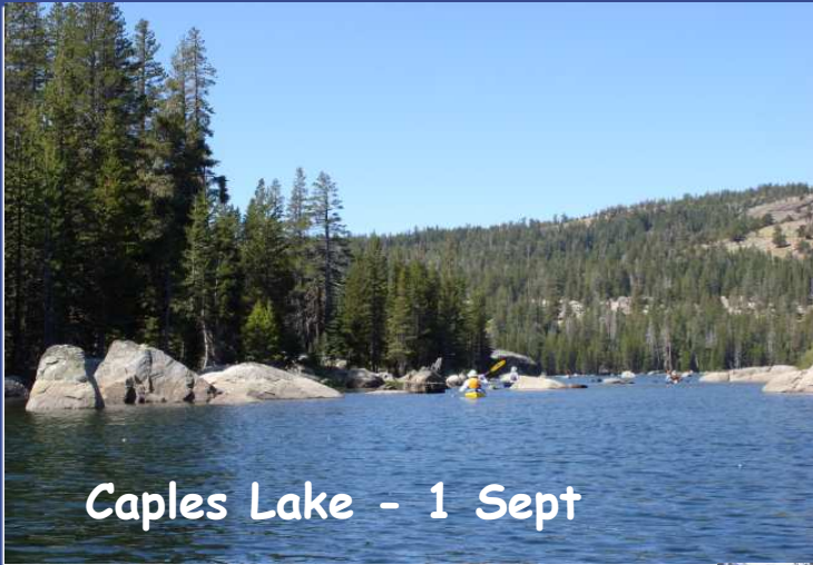
Caples Lake - 1 Sept