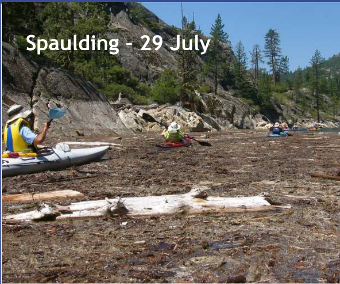
Spaulding - 29 July