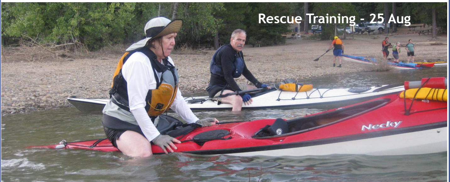
Rescue Training - 25 Aug