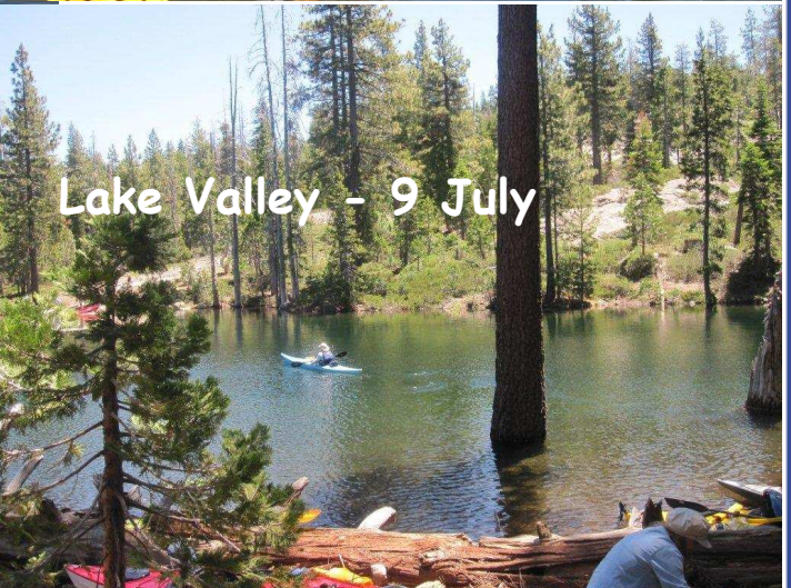
Lake Valley - 9 July